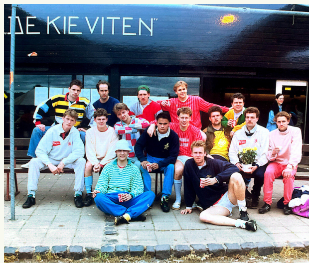
La Confrérie - Former Soccer Team

I was also part of the soccer team of La Confrérie playing every weekend. And also playing thrilling matches during BAVO weekends against the Hotelschools from Leeuwarden and Maastricht. After two years, I became a member of fraternity Party Colare which nowadays is still a very active fraternity. My love for organizing events started, I think, with organizing galas for La Confrérie.