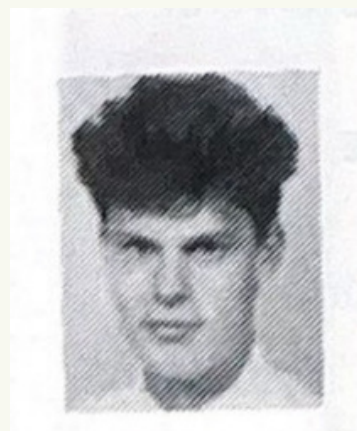
Smoelenboek from 1991